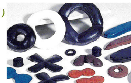
THE SHAPE OF RUBBER BLANK